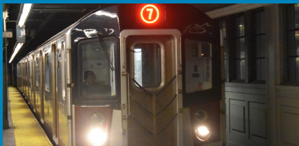
Queens Boro Plaza