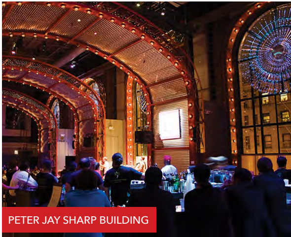
PETER JAY SHARP BUILDING