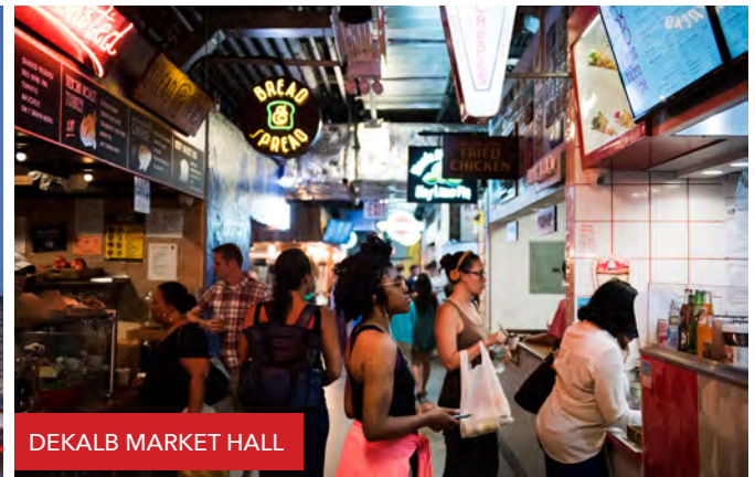
DEKALB MARKET HALL