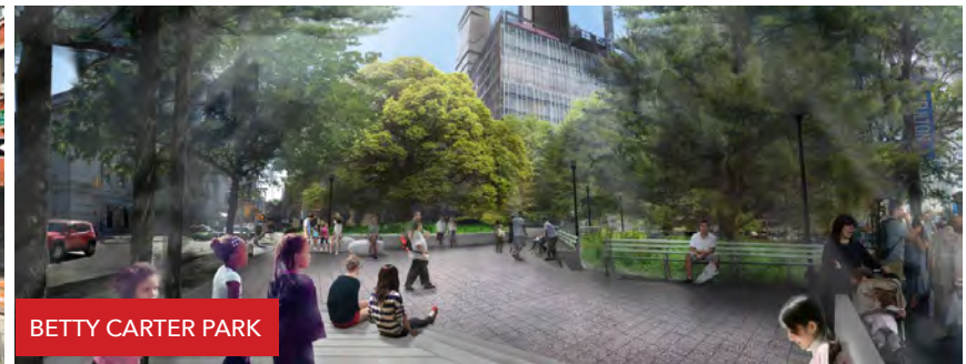
BETTY CARTER PARK