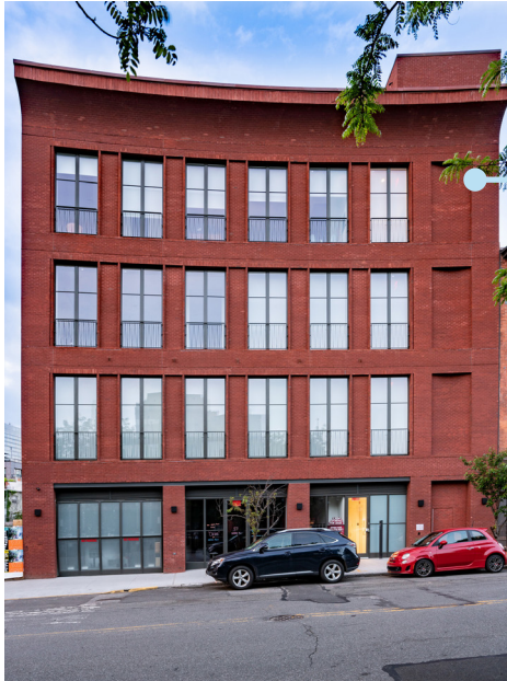
89 GRAND STREET